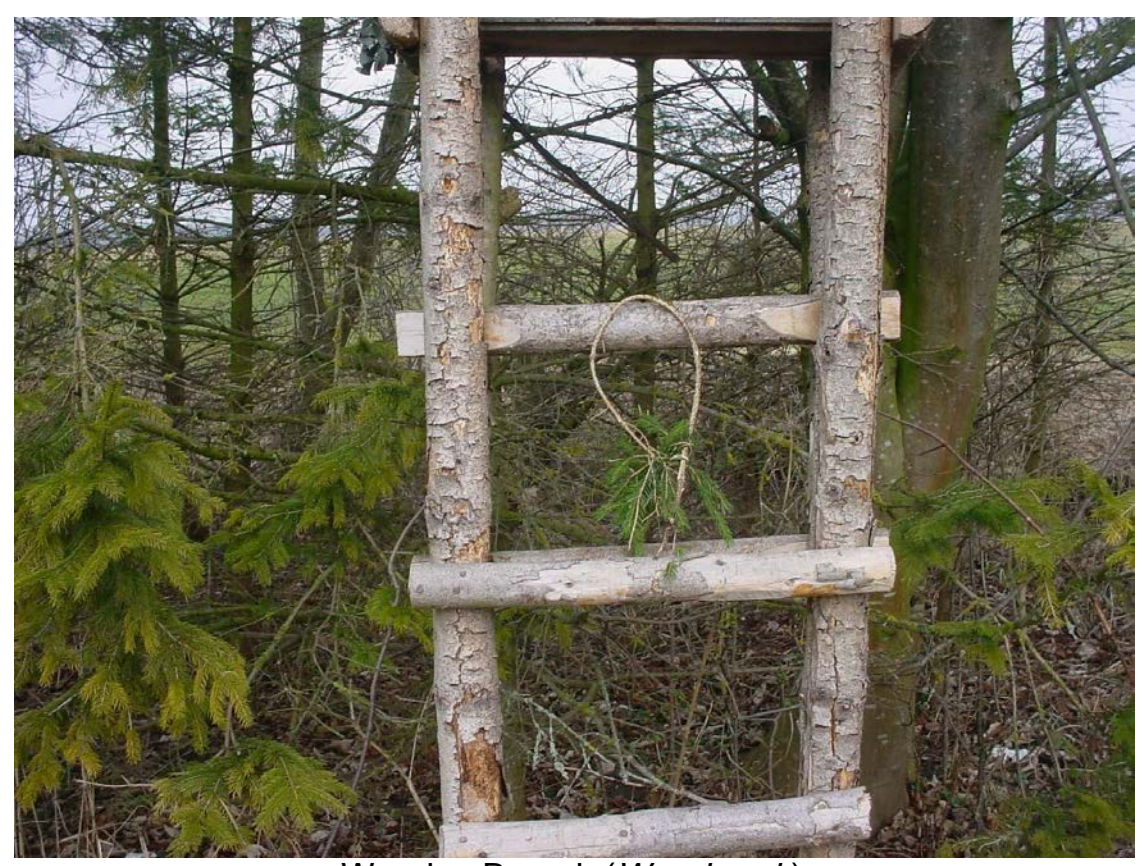
Warning Branch (Warnbruch)

The warning branch is hung from a tree or other conspicuous object indicating danger in the vicinity (for example, a trap, poachers, or an unsafe high seat).