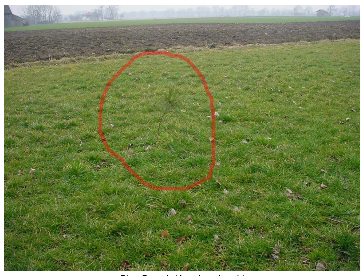
Shot Branch (Anschussbruch)

If undergrowth or trees make it hard to spot a shot branch, it is common to use a fluorescent ribbon to mark the point where the animal was hit by the bullet.