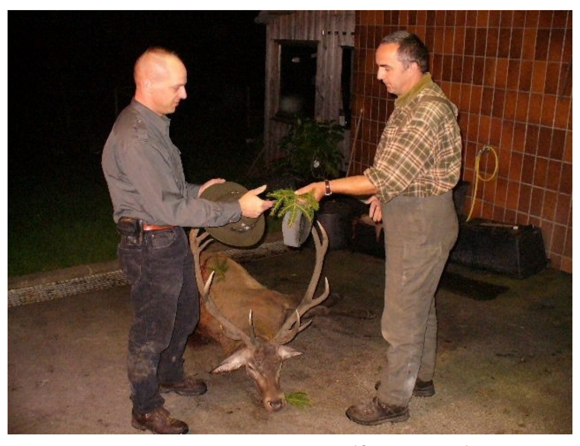
Receiving the hunter's branch (Schützenbruch)

When hunting alone, the hunter should remember to place the hunter's branch in their own hat.