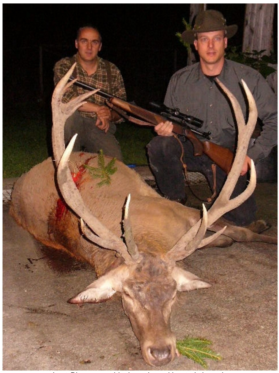
Last Bite, ownership branch, and hunter's branch (Letzter Bissen, Inbesitznahmebruch, und Schützenbruch)