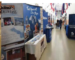
Sponsor Table Display