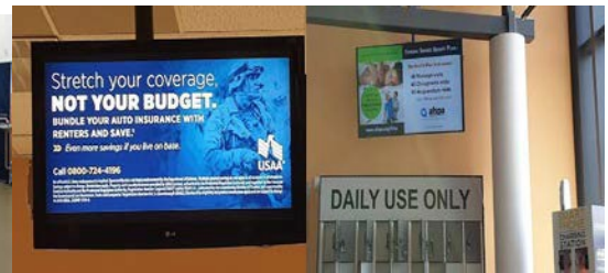
Digital Monitor Ad Displays