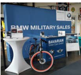
Drawing or Contest

Our goal in every sponsorship relationship is win-win! An investment with Family and MWR has value on multiple levels. Sponsorship may be in the form of cash, products or services, or a combination of all three. Sponsorship is not charitable donations.